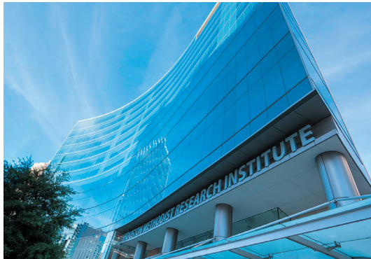
Houston Methodist Research Institute in the Texas Medical Center